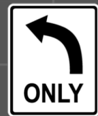
LEFT TURN ONLY