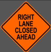
LANE CLOSED AHEAD