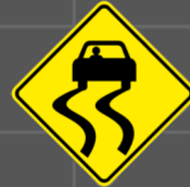
SLIPPERY WHEN WET