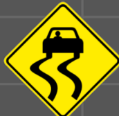
SLIPPERY WHEN WET