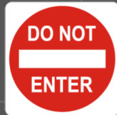
DO NOT ENTER