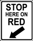
STOP HERE ON RED