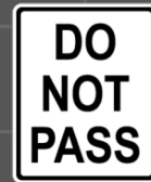
DO NOT PASS