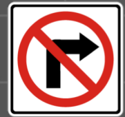
NO RIGHT TURN