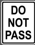
DO NOT PASS