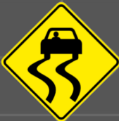
SLIPPERY WHEN WET