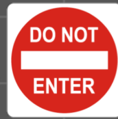
DO NOT ENTER