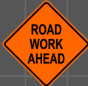
ROAD WORK AHEAD