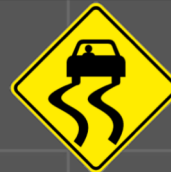
SLIPPERY WHEN WET