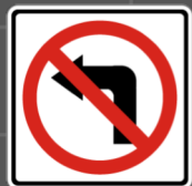
NO LEFT TURN