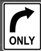
RIGHT TURN ONLY