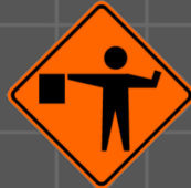
ROAD WORK FLAGGER