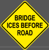
BRIDGE ICES BEFORE ROAD