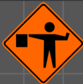
ROAD WORK FLAGGER