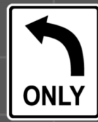
LEFT TURN ONLY