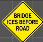
BRIDGE ICES BEFORE ROAD