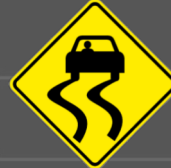
SLIPPERY WHEN WET