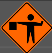
ROAD WORK FLAGGER