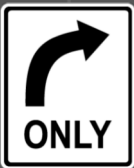
RIGHT TURN ONLY