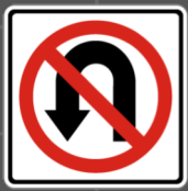
NO U TURN