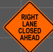
LANE CLOSED AHEAD