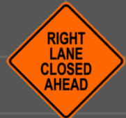
LANE CLOSED AHEAD