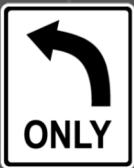
LEFT TURN ONLY