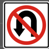
NO U TURN