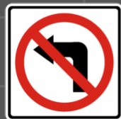
NO LEFT TURN