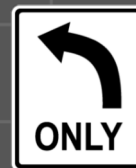
LEFT TURN ONLY